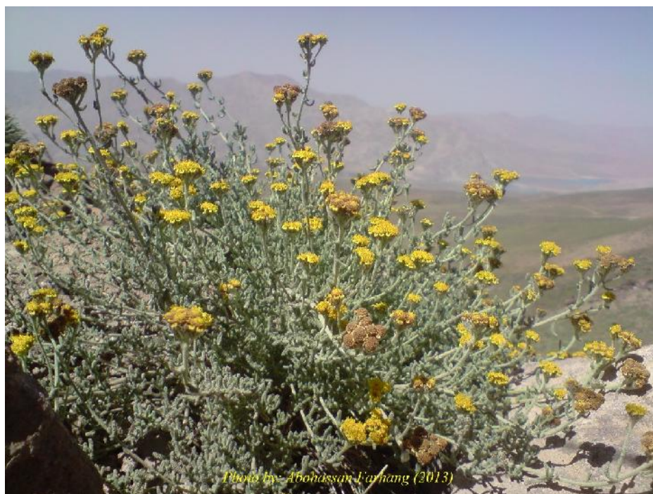
Fig. 2. A bush of Achillea aucheri In Damavand mount