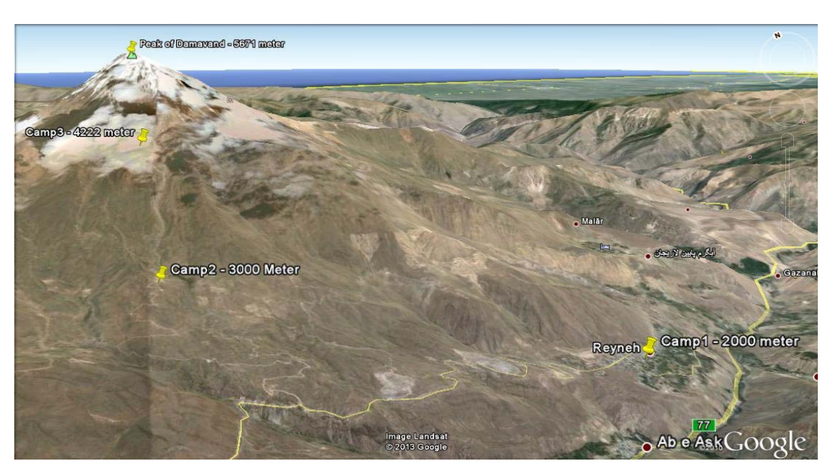
Fig. 1 Map of Damavand mount with 3 camps that the samples of Achillea aucheri were collected at track between camp 2 and 3.

Obtained data were analysed using SPSS program (Version.19) and mean comparison was done with Duncan multi range test in 5% and 1% probability level.