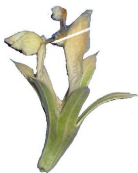
Fig. 3 Flower