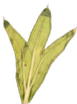
Fig. 2 Leaf