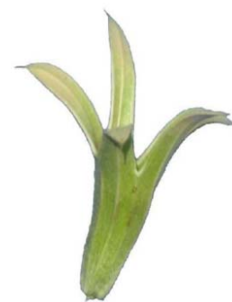
Fig. 4 Calyx