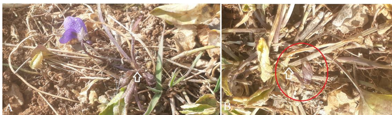
Fig. 14 Initiation of flower-producing meristems in the V. sintenisii species under field conditions in accordance with greenhouse observations.