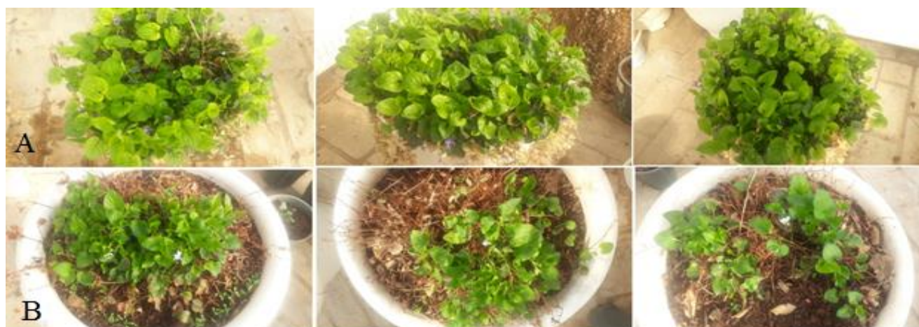
Fig. 13 Growing view of 2 studied species. A: V. sintenisii , B: V. caspia