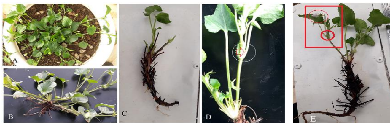
Fig. 12 Origin of flowering shoots in studied species and comparison of peduncle length from origin meristems. A & B: V. caspia , C: underground stem of V. caspia . D & E :Flower formation in higher plant nodes in the species V. caspia .