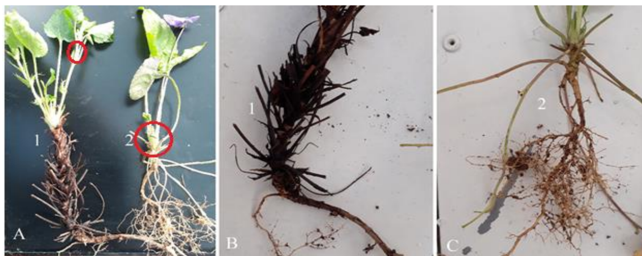
Fig. 11 Differences in the color and size of the underground stems in the two studied species.