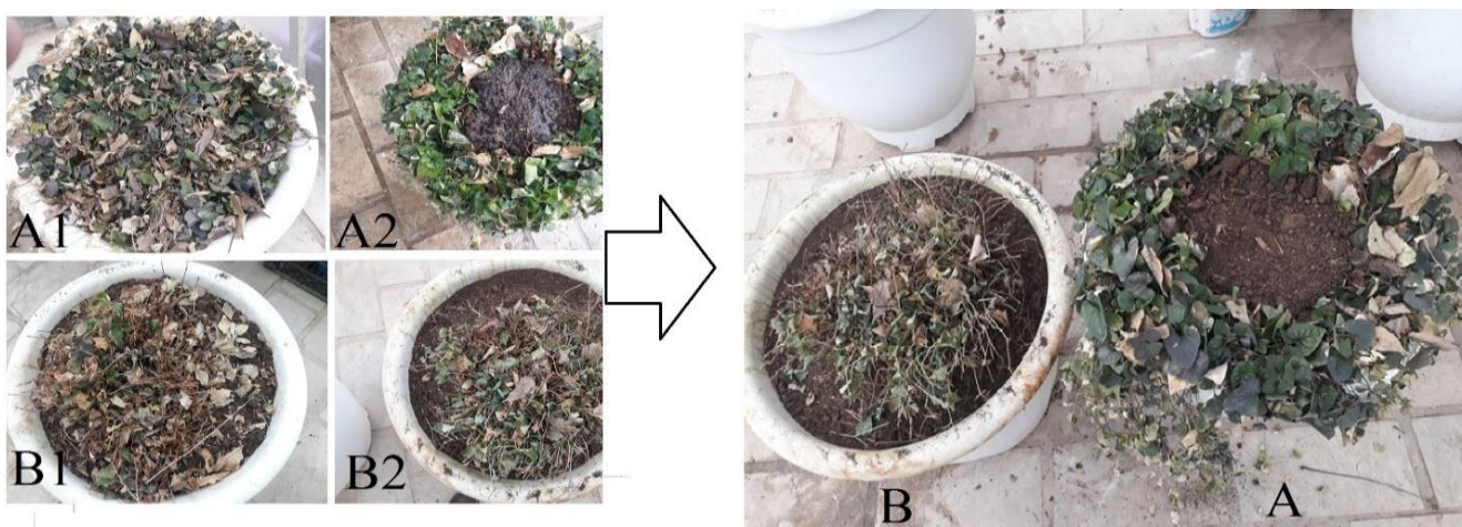
Fig. 8 Different effects of winter cold on the studied species. A1: V. caspia , B1: V. sintenisii in left and A: V. sintenisii , B: V. caspia . Tolerance to winter cold in the V. sintenisii is more than the V. caspia .