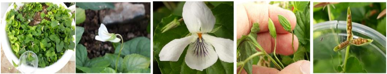
Fig. 7 Morphological characteristic and seed setting and fruiting of V. caspia in LCIV