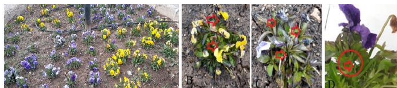
Fig. 15 Initiation of flower-producing meristems in the V. tricolor species under field conditions in accordance with greenhouse observations.