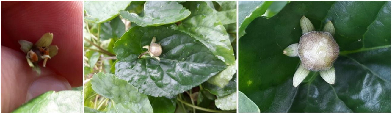
Fig. 5 The seed setting and fruiting of V. alba subsp. sintenisii in LCIV