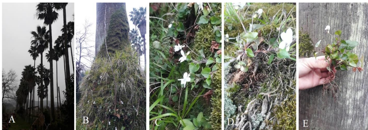
Fig. 2 View of the park in Lahijan, Iran (A) and the growth of white violets on the trunk covered with ornamental palm moss (B,C,D,E).

medicinal species of V. alba Bess, subsp. sintensisii and V. caspia are the two dominant species in the mentioned areas (Ammarellou et al. , 2021), which are shown in the relevant pictures (Fig. 4-14).