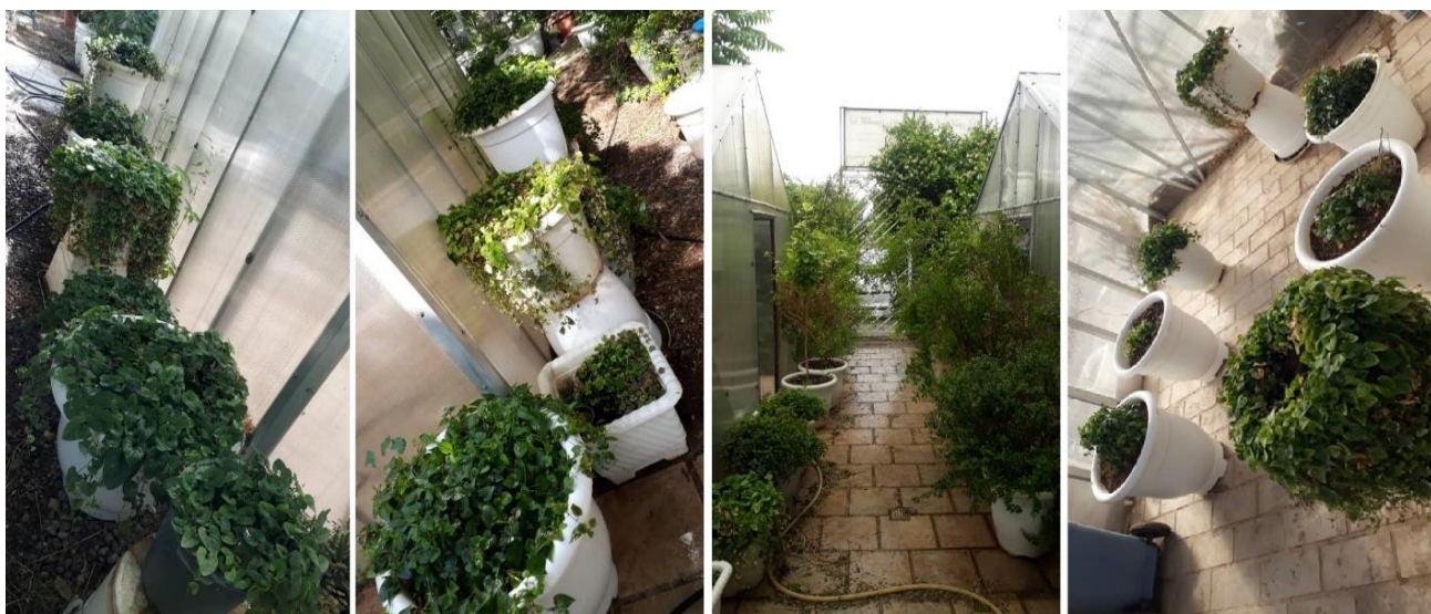
Fig. 3 Local live collection of Iranian Viola sp. Located on Research Institute of Modern Biological Techniques, University of Zanzan, Zanzan, Iran.