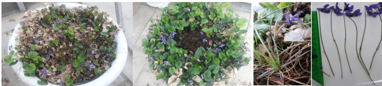
Fig. 9 Peak and maximum flowering in V. sintenisii