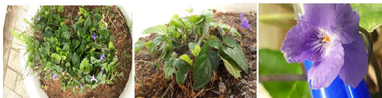
Fig.4 Morphological characteristic of V. alba subsp. sintensisii . established on LCV.