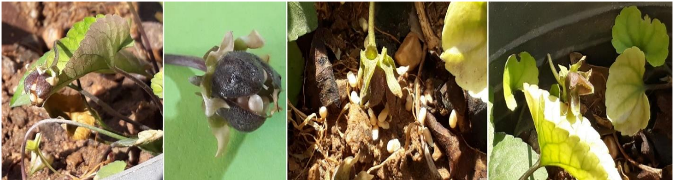
Fig. 6 Different stages of fruit and seed maturing in V. alba subsp. sintenisii in LCIV