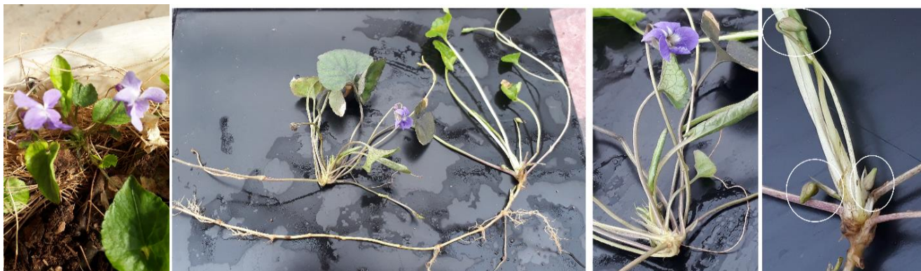
Fig. 10 Activation of flower meristem buds in mid-winter on V. sintenisii