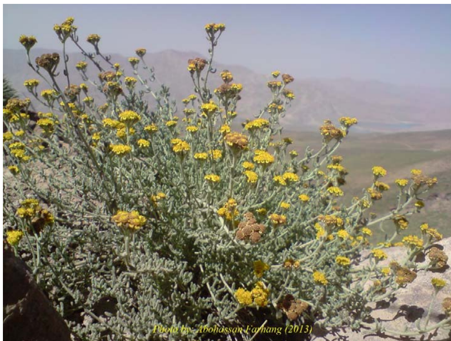
Fig. 2 A bush of Achillea aucheri in Damavand mount