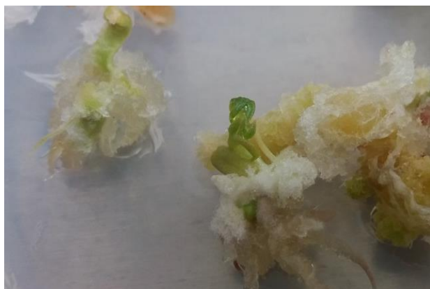
Fig. 4 Calligraphy and microenvironment regeneration in hypocotyl of 0.5 mg/L NAA.