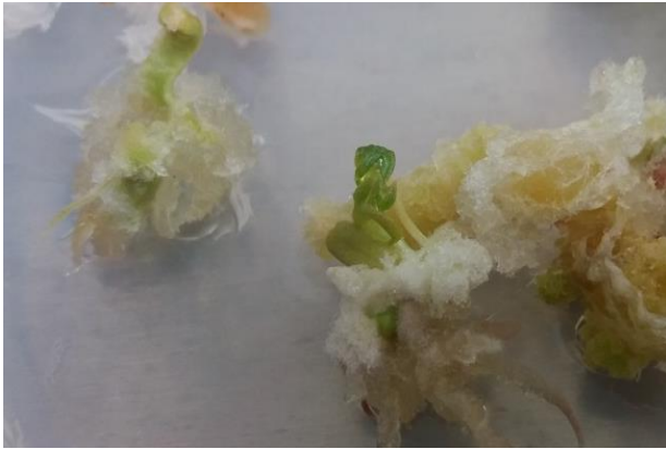
Fig. 4 Calligraphy and microenvironment regeneration in hypocotyl of 0.5 mg/L NAA.