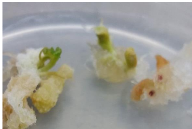
Fig. 3 Calligraphy and regeneration of leaf explants. Interaction between BAP and Leaf Sample at 0.5 mg/L.

In the second experiment, the effects of BAP, 2,4-D, and explants on callus production and direct regeneration in the medicinal plant of P. harmala L. were investigated. The analysis variance showed that the effect of BAP on callus formation and 2,4-D and explants on callus formation and regeneration were significant at 0.01 level. Interaction of explants in BAP on callus formation and interaction of 2,4-D hormones in BAP on callus formation and regeneration were significant at 0.01 level.