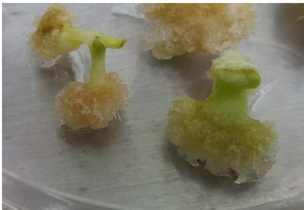
Fig. 5 Calligraphy and regeneration of fetal explanted related to the interaction between NAA and microbial samples at concentrations of 0.5 mg/L.

No significant differences were observed in the other interactions (Table 5). The level of callus induction and shoot regeneration enhanced by increasing the concentration of 2,4-D to 0.5 mg/L. The highest frequency of callus induction and shoot regeneration was achieved at 1 mg/L BAP, however, callus induction and shoot regeneration decreased at higher concentration and had suppressing effect.