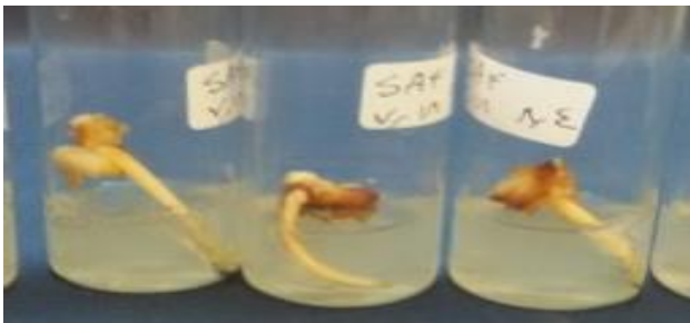
Fig. 2 Rooting induction in \frac{1}{2} MS medium supplemented with 0.2 mg/l BAP and 1 mg/l NAA