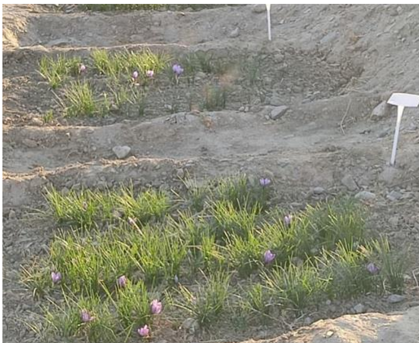
Fig. 3 Spraying with IAA (below) and control (a bow).

contents of soluble sugars, proline, and secondary metabolites (crocin, picrocrocin, and auxin) in the present study, which agrees with previous studies. In a study, SA use (1 mM) led to crocin content elevation and stronger antioxidant activity in stigmas among different treatments, with no negative effect on safranal content [35]. Similarly, the production of soluble carbohydrates, sugars, and secondary metabolites increased with SA application [36]. JA and its derivatives are complex compounds affecting a wide range of physiological and developmental reactions in plants [37]. JA is a compound that prevents leaf aging and fall, reduces free radical activity, stimulates ethylene biosynthesis, and enhances the enzymatic defense system in plants [37].