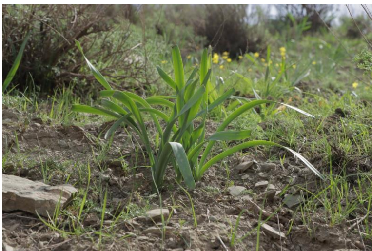
Fig. 1 Ungernia victoris . Mature plants observed near the village of Nilu, Surkhandarya region, Uzbekistan. Photo by D. Turdiev, taken on 27 March 2022

Ptelea trifoliata L. (Rutaceae), common hoptree or water ash (PT). The plant is a small tree or often a shrub with a few spreading stems, typically reaching a height of 6–8 m and forming a broad crown. The fully grown leaves are dark green and glossy on the upper surface, with a paler green underside. In autumn, the leaves transition to a rusty yellow color. The flowers are small, measuring 1–2 cm across, and have 4–5 narrow, greenish-white petals. The fruit is a round, wafer-like, papery samara, 2–2.5 cm in diameter, light brown in color, and contains two seeds. The fruit ripens in October and remains on the tree until high winds dislodge them in early winter [51 - 56] (Fig. 2).