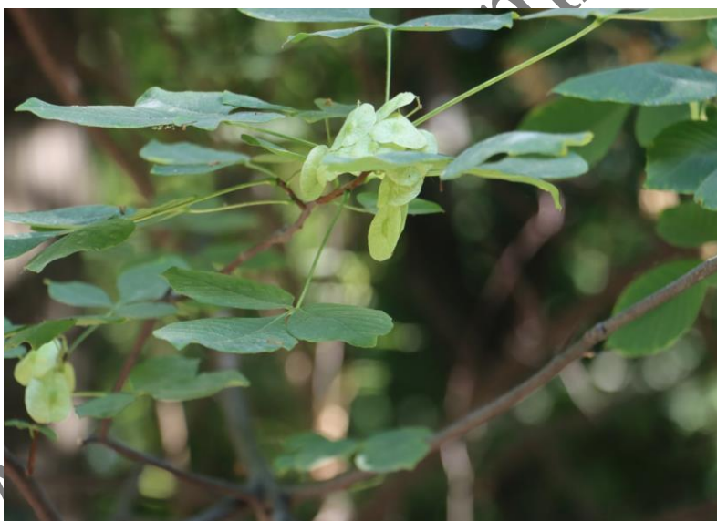
Fig. 2 Ptelea trifoliata . Specimen from the Tashkent Botanical Garden, Tashkent. Photo by A.T. Khazratov, taken on 23 August 2024

Ptelea trifoliata L. (Rutaceae), common hoptree or water ash (PT). The plant is a small tree or often a shrub with a few spreading stems, typically reaching a height of 6–8 m and forming a broad crown. The fully grown leaves are dark green and glossy on the upper surface, with a paler green underside. In autumn, the leaves transition to a rusty yellow color. The flowers are small, measuring 1–2 cm across, and have 4–5 narrow, greenish-white petals. The fruit is a round, wafer-like, papery samara, 2–2.5 cm in diameter, light brown in color, and contains two seeds. The fruit ripens in October and remains on the tree until high winds dislodge them in early winter [51 - 56] (Fig. 2).