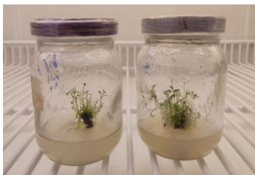
Fig. 3 Plant cultivation in rooting medium

The high survival rate observed indicates that the rooting and hardening protocols established in this study effectively prepared Zarrin-giah seedlings for successful establishment in soil conditions. Similar survival percentages have been reported in other species where stepwise acclimatization strategies were employed [6]. This high survival rate is critical for the overall efficiency of micropropagation protocols, ensuring that in vitro gains translate into viable plants in the greenhouse or field. The combination of rooting in vitro followed by phased hardening in the phytotron and greenhouse provides a robust approach to producing healthy, well-adapted seedlings. This method can be recommended for large-scale propagation and conservation efforts of Zarrin-giah and potentially other related species. The results of this study revealed that the rooting and hardening protocols utilized for Zarrin-giah seedlings were highly effective in producing viable plants that were able to successfully establish in soil conditions. This is evidenced by the high survival rate observed, which is consistent with similar percentages reported in other species when employing stepwise acclimatization strategies [6]. This finding is significant as it demonstrates the successful translation of in vitro gains into healthy and well-adapted seedlings in the greenhouse or field.