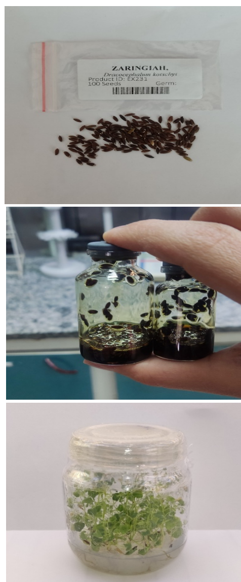
Fig. 1 Seeds of D. kotschyi , Sterilized seeds and Plants derived from seed germination Respectively from up to down.

The breaking of seed dormancy is a crucial step in the successful propagation of plants. To ensure optimal growth and development, proper measures such as soaking the seeds in 98% sulfuric acid for 15 minutes and sterilization with 70% ethanol for two minutes, followed by treatment with 2% sodium hypochlorite for five minutes and constant shaking were taken. The seeds were then rinsed with distilled water to remove any residual chemicals. Once sterilized, the seeds were cultured on MS medium supplemented with 750 mg/l gibberellic acid. The resulting seed germination and growth produced healthy plant specimens that were used as the source of explants for further experimentation (Fig. 1).