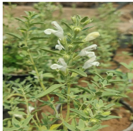
Fig. 5 D. kotschyi plant after acclimatization

Furthermore, the combination of in vitro rooting followed by phased hardening in the controlled environment of the phytotron and greenhouse has proven to be a reliable method for large-scale propagation and conservation efforts of not only Zarrin-giah but also potentially other related species. Overall, these results highlight the importance of stringent protocols in micropropagation for ensuring high survival rates and ultimately, the success of propagation and conservation efforts for valuable plant species.