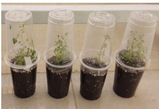
Fig. 4 Acclimatization stage of the propagated plantlets